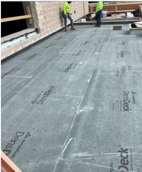
Installing Low Roof