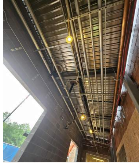
MEP Overhead Rough- In