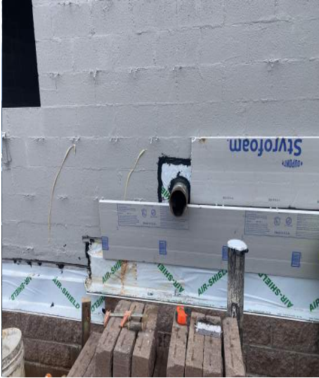
Waterproofing & Split Face Block Installation at Perimeter